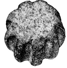
sacred cog stone