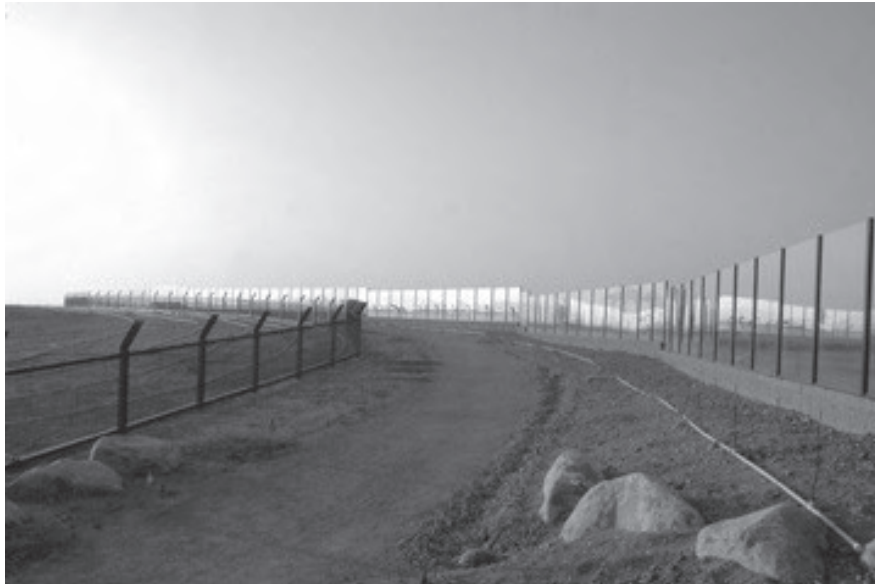
The "Wall of Death" stretches for more than 4,400 feet and is responsible for numerous bird deaths at Bolsa Chica.

Hearthside Homes has built a 4,400-foot long plexiglass wall dubbed "The Wall of Death" at the Brightwater development adjacent to the public trail west of the project. The five-foot high panes are part of a wall that is in some places seven feet tall.